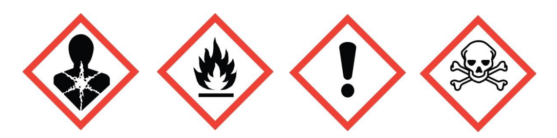
Section 3: Composition/Information on Ingredients