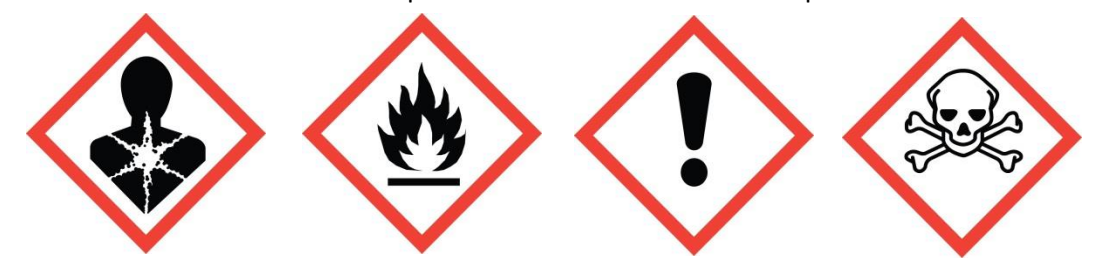
Section 3: Composition/Information on Ingredients