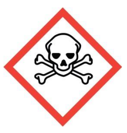
Section 3: Composition/Information on Ingredients